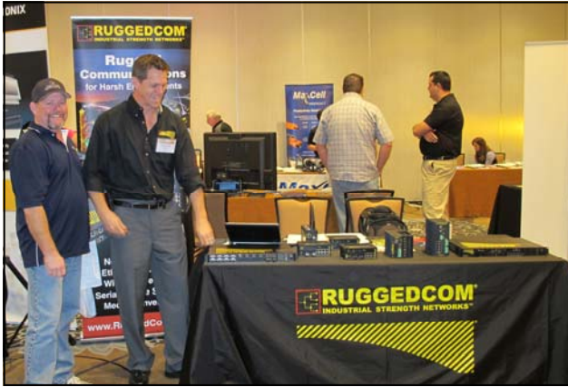
Traffic signal communication equipment show-and-tell