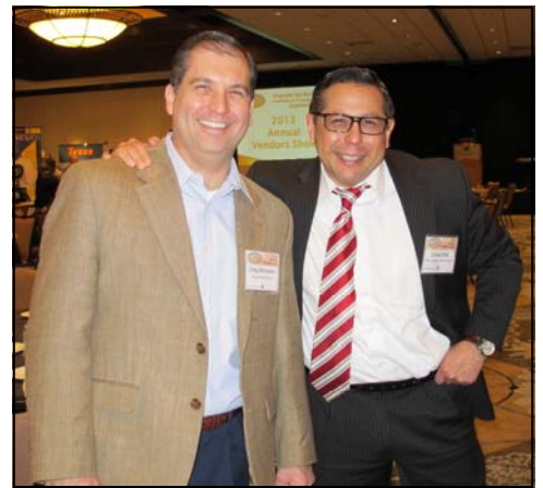
Two former Section Presidents get caught up