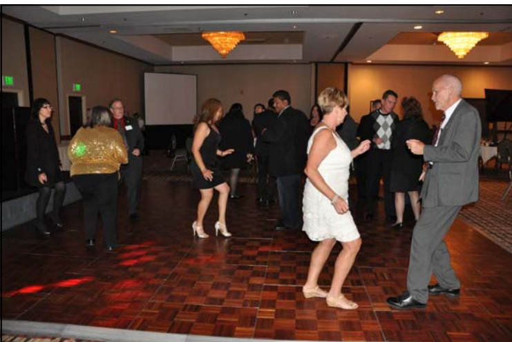
Dancing after dinner is a great way to cap off any special evening