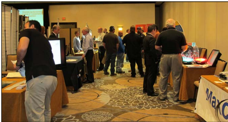
Walkways were crammed with people looking to learn more about the latest products