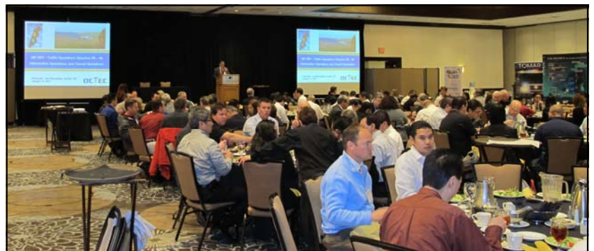
Attendees lunch and learn about the latest in inductive-loop bicycle detection