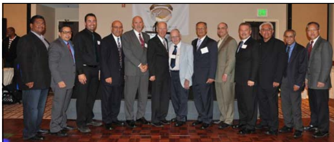
Former and current leadership were honored