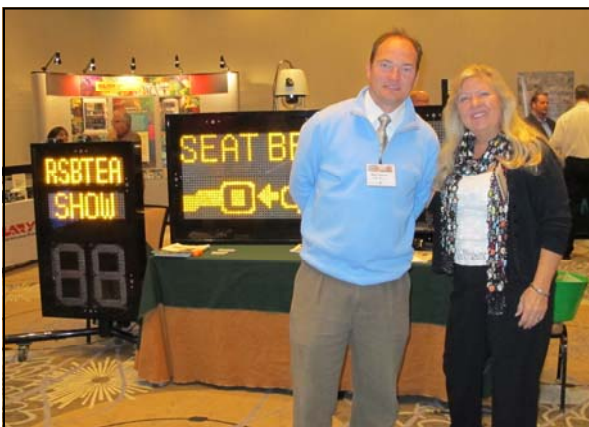
Fortel Traffic displaying their signs