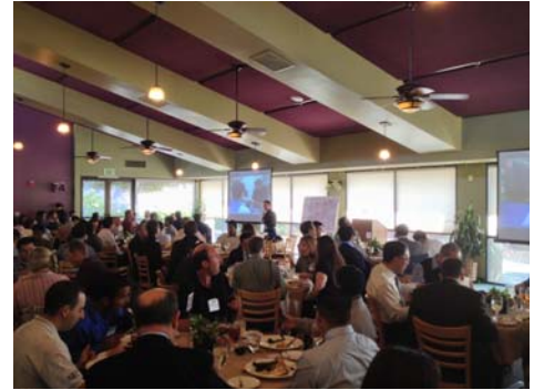
Attendees of the November meeting at Cal Poly Pomona

Endeavor was being transported by a remote controlled wheel base mechanism. The wheel base narrowed when needed to make tight turns and expanded to drive over concrete median islands. Many steel plates were laid out to pass over sensitive vaults and trees were trimmed or removed when necessary. A total of 48 traffic signal mast arms, 67 signals, and 179 signs