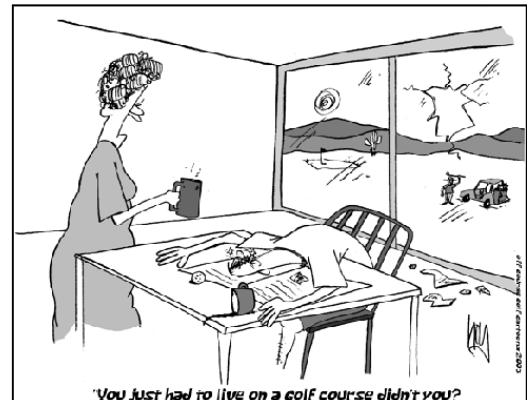
How residents of Menifee Lakes perceive our golfing skills (from golfjokes.co.uk)